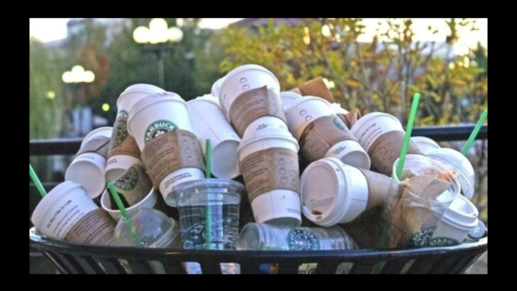
Think before you throw!

Did you know Starbucks paper cups are NOT recyclable , and over 4 billion end up in landfills each year?